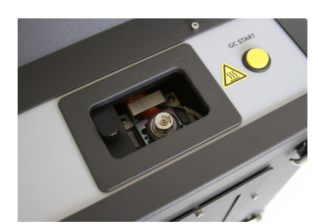
Split/Splitless Injector Port

The FLIR Griffin 400-series GC/MS (Gas Chromatograph / Mass Spectrometer) products provide lab-quality chemical identification in a field-ready package that anyone can use. Hassle-free, interchangeable sampling tools differentiate each GC/MS model and are available for air, liquid, and solid samples. The Griffin 410 model, like the other 400-series products, contains an integrated split/splitless injector port. It is the same injector found on standard laboratory-based GC/MS systems and accepts revolutionary sample introduction tools like the PSI-Probe™, without sacrificing the ability to perform more traditional techniques. The Griffin 460 model includes an additional integrated universal sampling port, providing direct air sampling capability, while also accepting plug-and-play samplers. Within 15 minutes, the systems accurately detect and identify explosives, drugs, CWAs, TICs, environmental pollutants, and other chemicals.