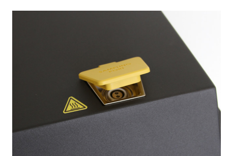
Universal Sampling Port