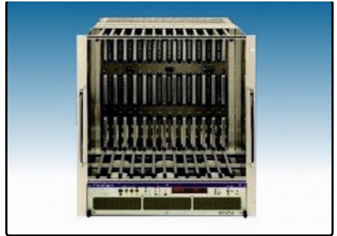
VXI-D size 6021