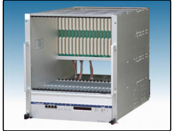
9U VME64x 6023