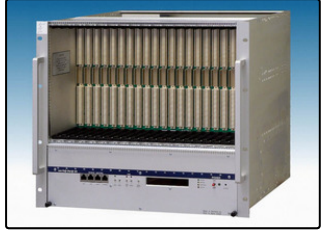
6U VME64x 6023