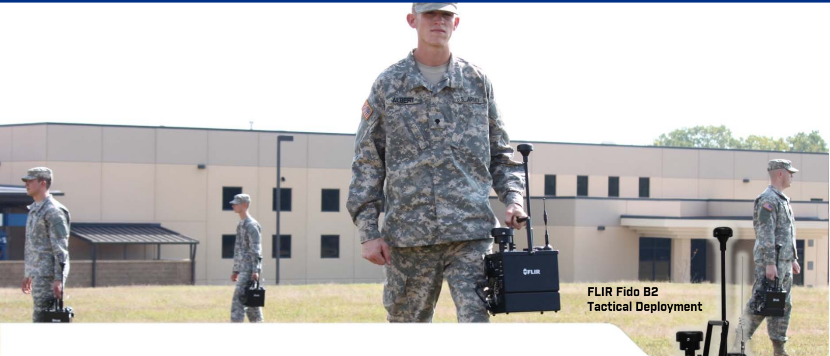
FLIR Fido B2 Tactical Deployment