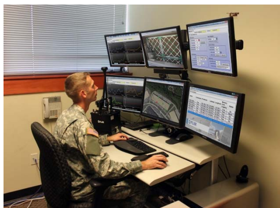
Figure 1. Central Command Station

Maintenance is minimal and a tool kit is included to perform standard preventative maintenance actions. Maintenance includes replacing the inlet filter screen. The bio-detection kit is packaged in Pelican™ cases for easy packaging and transport.