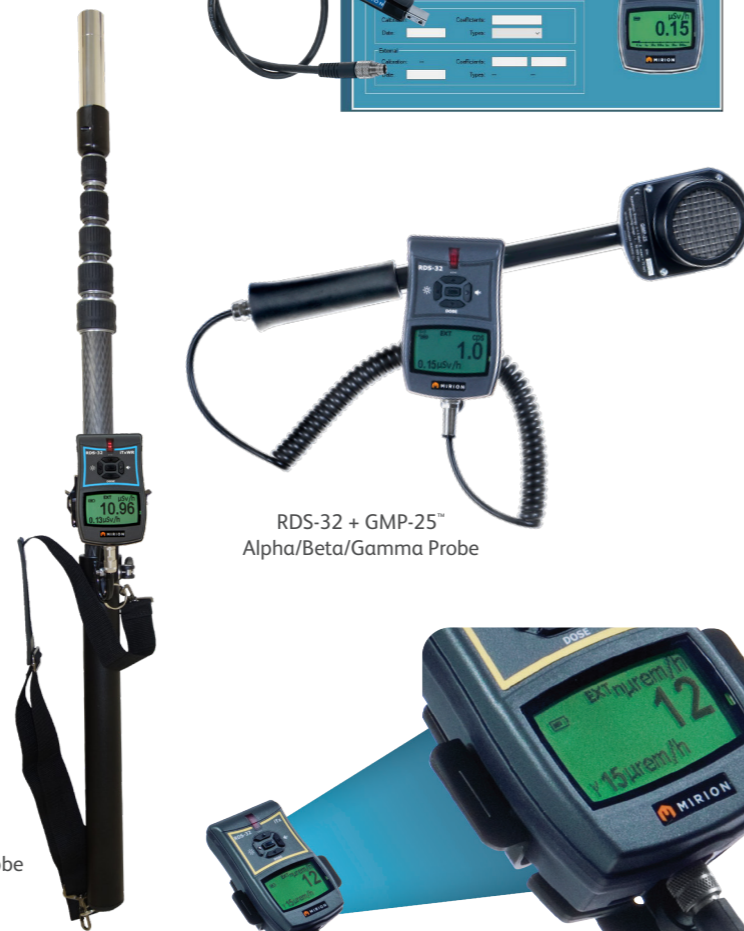
RDS-32 + GMP-25™ Alpha/Beta/Gamma Probe