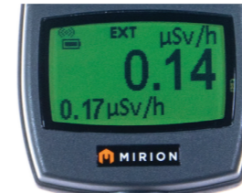
Display with Gamma Probe