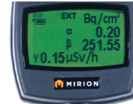
Display with Alpha/Beta Probe