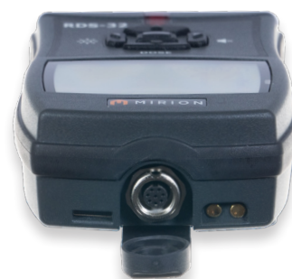
Connector, charging contacts, fixing lug for wrist strap