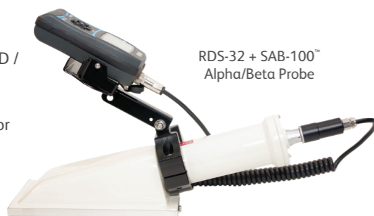
RDS-32 + SAB-100™ Alpha/Beta Probe