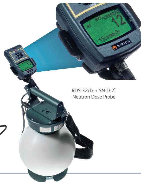
RDS-32iTx + SN-D-2™ Neutron Dose Probe