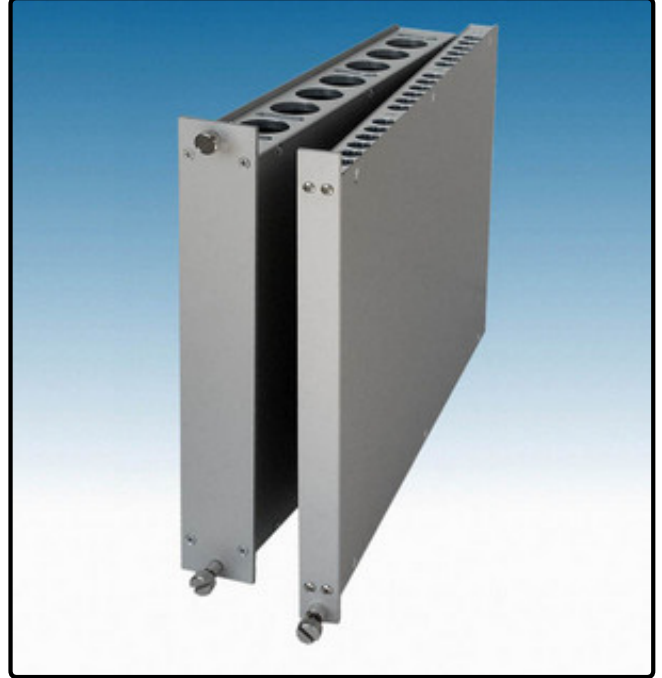
Blank CAMAC mechanics / cassette