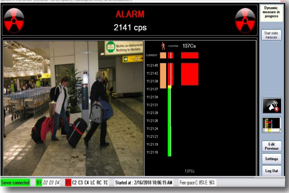
Portal interface display