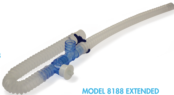
MODEL 8188 EXTENDED